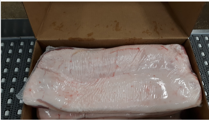
Product in COV